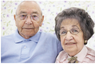
Support for Older Carers