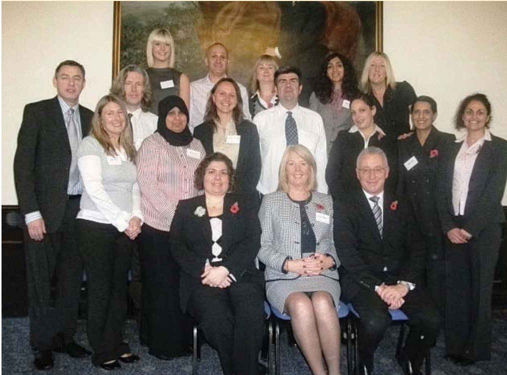
A very Happy Christmas from all at Barnet Carers Centre